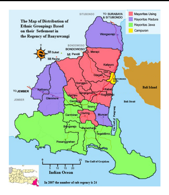
Figure 2: The Distribution of Settlement of Based on Ethnic Grouping

Based on the number of accidence it is clear that most of the violence broke out within social community of Using-Ethnic group. The map of accidence below may describe the location.