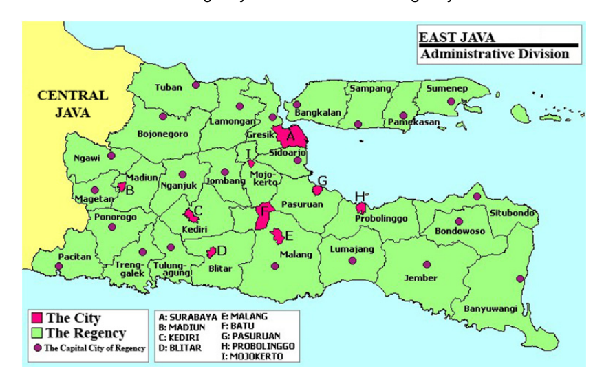
Figure 1: Map of East Java

Collective violence in this context can be defined as a series of actions against humanity committed by a community or group of people collectively intended just to hurt, to cause physical injury or even to kill some body or group of people who were accused to have practiced black magic against some body. The Regency of Banyuwangi is one regency locates in the east end of Java island. The Regency of Banyuwangi covers ± 5.782,50 kilo meters square or approximately 12 % of the whole area of East Java. Besides, the regency has coastal line as long as 175,8 kilometers with 10 islands (from: http://www.syncOnConnect time=1177956727). Geographic position of the Regency of Banyuwangi lays between the coordinates of 7<sup>o</sup> 43'- 8<sup>o</sup> 46' South Longitude (SL) and 113<sup>0</sup> 53' - 114<sup>0</sup> 38' East Latitude (EL). This regency is adjacent to some such neighbouring regencies as the regency of Situbondo in the North, Bali Strait in the East, Indian Ocean in the South and both the Regency of Jember and the Regency of Bondowoso in the West.