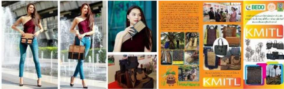
Fig. 4: Model products made from palm family leaf fibers and documents to transfer knowledge into society