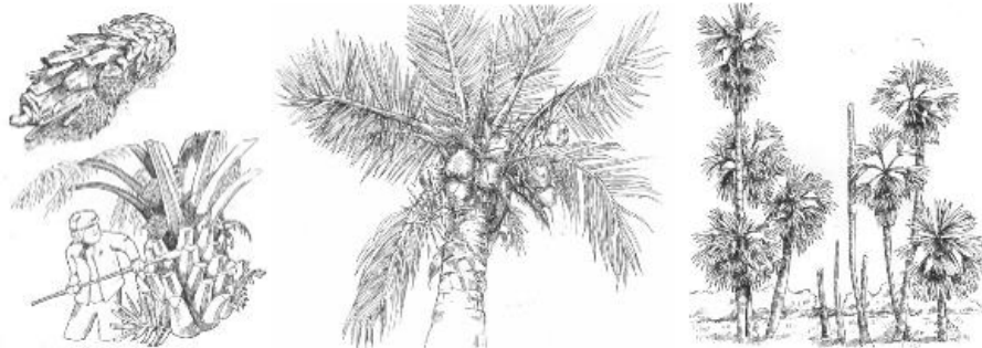
Fig. 1: Palm family plants in Thailand

Because of the price effects and the selling quantities from palm family production with the continuous decreasing trends such as coconuts, tans, and betel nuts with fewer customers, it contributed to the cultivation areas of these plants decreasing by 2.53-4.76 percent each year. Besides, the cultivation of the palm family has taken an uncertain direction at present as farmers look for more stable income sources through planting. The problem is that farmers who always cultivate only plants from the palm family and rely on this production as their main source of income will cause the non-stabilization of their incomes and lives. The farmers will then begin a new trend to increasingly cancel the cultivation of the palm family, especially where they have a lower consumption ratio for certain palm family types, such as tans, betel nuts, oil palm plants, and coconut plants. Similarly, the declining prices of these plants result in the realization by the farmers to cut plant cultivation by less than 20% per year due to the poor situation from sale prices.