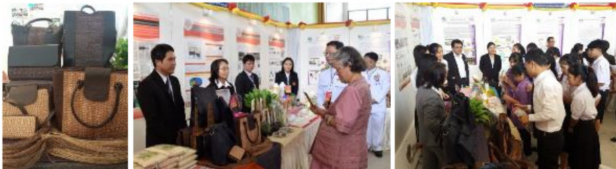
Fig. 5: Reporting on research in front of Her Royal Highness Princess Maha Chakri Sirindhorn at Chulachomklao Royal Military Academy

When the products made from new palm family leaf fibers were at a satisfactory level from community people in agreement with the manufacturing effectiveness, it makes it possible to bring the manufacturing products made from palm family leaf fibers into general publication for the public. After that, the publication procedure can commence with public relations covering the new knowledge of the palm family leaf fiber processing and new product patterns. Thus, it can present the products into the markets, representing the uniqueness of palm family fibers through their beauty and effectiveness. The research team was given kind support by Her Royal Highness Princess Maha Chakri Sirindhorn to report the results of research on palm leave fiber products in front of Her Royal Highness at Chulachomklao Royal Military Academy.