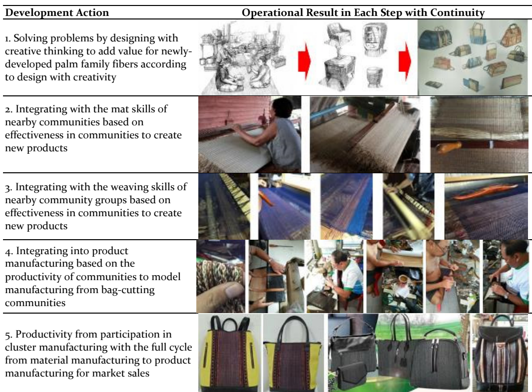
Table 3: Data integration from theory principle into creative thinking for development action and operational result in each step with continuity

According to the combination of weaving procedure with industrial work patterns in the communities, it can add economic value and beauty value from the communities' skills (Phaliewnich, 1999). Besides, it contributes suitably to the value of creative work from palm family fibers based on the effectiveness of clothes weaving skills and mat weaving skills in the communities. In this case, it can build up strength to transform the groups for manufacturing palm family fibers, and it should gain from the participation to show the opinions of people in the communities. Finally, the community group makes it possible to bring the cotton fibers to be woven because of the possibility of earning a lot of material in their local areas. In addition, it helps in measuring the greatest level for tensile properties according to cotton length at the level of 1593.13 N/cm 2 per percentage point and with the stretching ratios to the cotton length at the level of 11.67 N/cm 2 per percentage point from participation between communities. As a result, it contributes to product creation to gain a higher level of value from the leftover materials of the four types of palm family leaves in the communities (Malkapuram et al. , 2008).