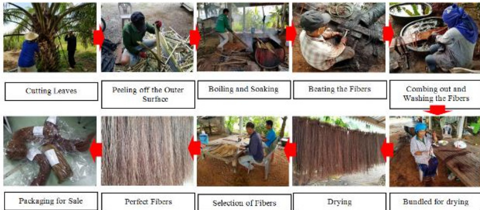
Fig. 3: Processing procedure for palm family fibers with people in communities