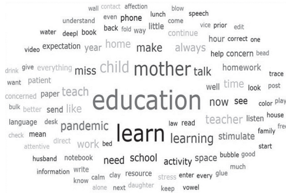
Figure 1: Preliminary sense of the study based on keywords

These keywords highlight how the pandemic affected children's education and development, and how mothers, teachers, and the community cope and work together to provide a nurturing educational environment despite the circumstances, as seen in Figure 1.