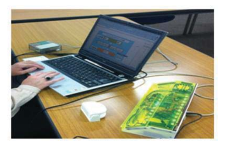
Figure 4 Proposed smart environment

Every IC Tag card can be connected with Powerpoint slides (one IC Tag for one slide). All information is saved in an Access database. Every time that IC Tag card touches the IC Tag reader, the slide connected with this card is displayed on computer screen (except computer screen also video projector, robots can be used).