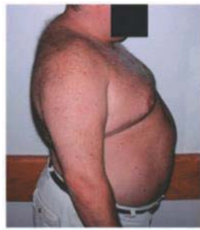
Fig 1. HAART-related fat relocation syndrome. Buffalo hump and raised abdominal girth. Leow et al. • Clinical Review J Clin Endocrinol Metab, May 2003, 88(5):1961–1976

The correlation among the level of insulin resistance and ranks of soluble type-2-TNF-alpha receptor recommends that an inciting spur may contribute to the progress of HIV-allied lipodystrophy (Mynarcik DC 2000). TNF alpha stimulates 11-beta-hydroxysteroid dehydrogenase type-1 that transfers static cortisone to active cortisol. The movement of this enzyme is more elevated in visceral fat in contrast to subcutaneous fat. Visceral fat can generate cortisol that might proceed within adipocytes and raise lipid gathering (Gougeon ML & Penicaud L 2004). There is data for nucleoside-stimulated mitochondrial failure in HIV-infected subjects cured with nucleoside holding HAART since lipodystrophy with tangential fat dissipating is linked with a regression in subcutaneous fat storing tissue mitochondrial DNA substance (Depairon M et al 2001). This result has been particularly explained with the application of stavudine and was connected with the duration of revelation to this medicine (Seminari E & Tinelli C 2002).