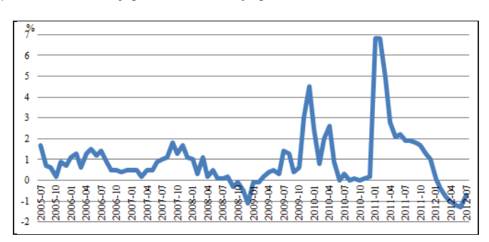
Figure1: The housing price index monthly growth rate in Beijing from 2005 to 2012

The recent boom in the housing market in Beijing, capital of China, provides a good opportunity to assess the evidence for a bubble and find reasons for its formation. Over the last decade, residential prices in Beijing have increased at an annual nominal rate of 20 percent. Figure1 shows the monthly percent change of housing prices from 2005 to 2012 in Beijing. The growth rate of housing prices kept increasing during most of the time after 2007, but fell sharply into negative territory in 2008 as a result of the global financial crisis. It revived and reached a new and record high in 2009 as China started to recover from the crisis, but decreased in the first half of 2012. Supply of housing has increased with demand but the rising prices suggest that the growth in demand has outstripped the increase in supply. This is demonstrated by what happened in Tongzhou, one urban district in Beijing: it had 1.87 billion square meters of living space under construction in the first quarter of 2010, 36% more than in the first quarter of 2009; however, prices in Tongzhou in the same period still increased by 20.8%.