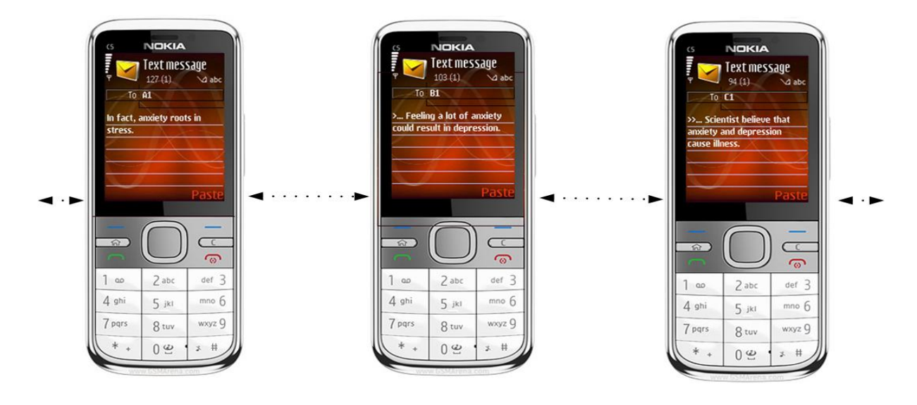
Figure 2. A sample of mini-story written by a group of learners

This model was designed for converting what might be of ordinary and traditional way of teaching vocabulary into authentic and interactively motivating learning opportunities employed for learners' suitable performance and for optimal feedback. In fact, teaching in this manner set up the social ground and opportunities for learners to receive, think, take risk, and process feedback from their counterparts. In addition, triangular interplay among students as a member of small groups brings flexibility and openness to change. Furthermore, this way of learning stimulates them to combine reading and writing. Figure 2 shows a ministory which was written by a group of learners.