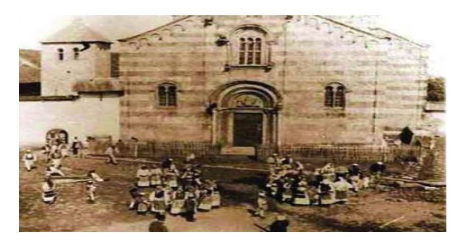
Fig: Dressed in typical Albanian clothes, one can see Albanian followers in the frontyard of the church.

On the other hand, there is evidence to support the argument that this monastery was considered a place of worship by Albanians. For centuries on, the Albanians in Kosova have preserved, protected and maintained the medieval Orthodox churches and monasteries, which stand to this day unharmed. The Orthodox churches were considered by Albanians as churches of their ancestors, and they were therefore sacred to them. That these places of worship were used by their predecessors can be confirmed through historical photographs.