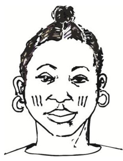
Figure 10. Man with Abaja Olowu. Illustration by Ségun Ajíbóyè, 2010.

Figure 11. Lady showing Pélé. Illustration by Ségun Ajíbóyè, 2010.