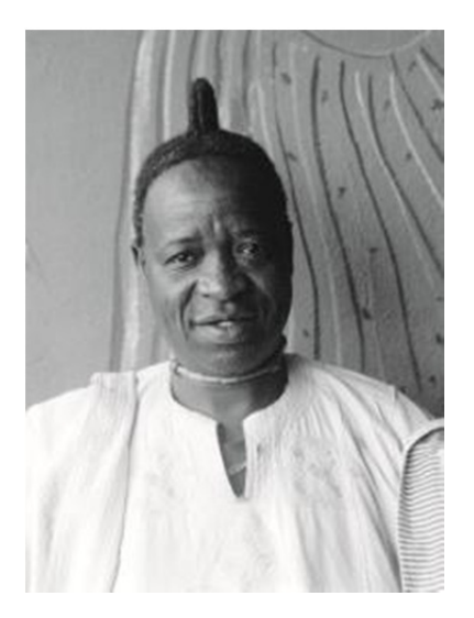
Figure 1. Sango devotee. Photograph by Uli Beier, 1960 (Institute of Cultural Studies Obafemi Awólówo University, Ile-Ife