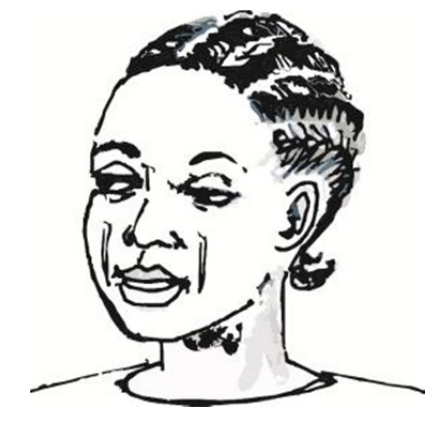
Figure 7. Irun Kíkó. Hairstyle usually achieved by using rubber or cotton thread wound around the hair. Photograph by Stephen Folárànmí, 2007

Figure 8. Girl with facial marks of the Òndó people. Illustration by Ségun Ajíbóyè, 2010.