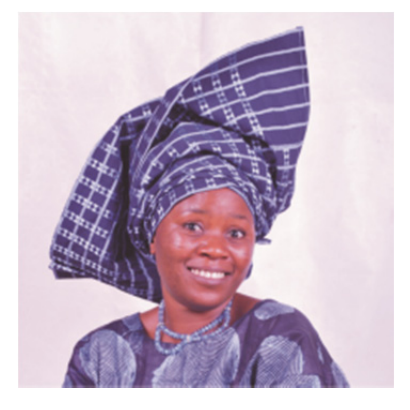
Figure 14. Lady with Yoruba Gèlè made out of asọ-òkè.