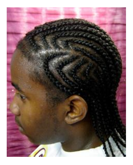
Figure 2. Contemporary hair plaiting among men in the twentieth and twenty first century.

The Yorùbá female hair is more elaborately treated than the male hair and in it can be seen the creativity of the Yorùbá in hair decoration. The female hair is left to grow and decorated by weaving and threading it into different coiffeurs which are identifiable by generally recognized names. Compared to weaving, threading is considered recent. Both manners of hair decoration are considered as household knowledge handed down from generation to generation among women. One of the most common hair weaving style is şùkú which cuts the hair into woven strands stuck to the head and running from the base of the head to the center, ending in a small protrusion (Fig. 3). The şùkú hair style is sometimes considered royal. Certain hairstyles are reserved for royal-hood and are not to be done on any commoner's head (Fakeye, Haight, Curl, & Gallery, 1996). Other Yorùbá weaving styles are korobá, kòlésè, panumó eléègé, oko ńlo- oko ń bò, ìpàkó elédè e.t.c. (Figs. 4, 5, 6, 7). Yorùbá hair weaving are practical applications of ojú onà, design consciousness and ojú inú , inner eyes which is particularly required at the starting points of weaving.