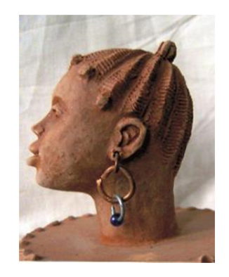
Figure 4. Sculpture showing sùkú hairstyle. Ségun Ajíbóyè, terracotta, 2005.