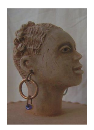
Figure 5. Sculpture showing kòlésè hairstyle by Ségun Ajíbóyè, terracotta, 2005.