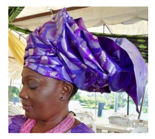
Figure 15. Woman with Yoruba Gèlè made out of damask material. Photograph by Mojúbàolú Okome, 2008