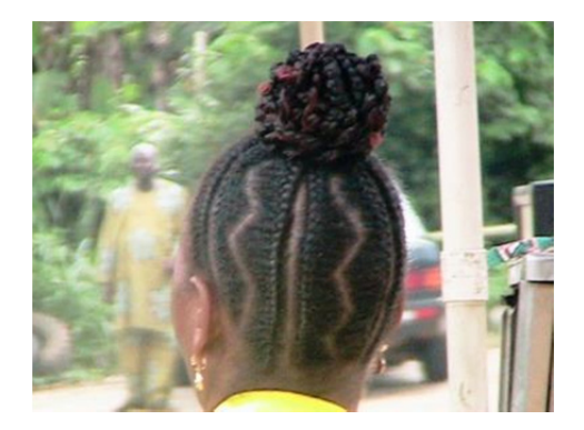
Figure 3. Yoruba woman with sùkú hair style. Photograph by Stephen Folárànmí, November, 2007.

The art of cutting Yorùbá facial marks<sup>10</sup> requires a high skill with an abundance of ojú inú , inner eye to determine precision in cutting so that it does not become ugly when the child becomes an adult. A lot of Ìfarabalè , calmness is therefore required to be able to cut without harming the child. Imójú móra , curtailment of excesses keeps the olóòlà from absorbing disrupting artistic innovations that may alter the facial marks; this will not be welcomed since the facial marks are expected to be group identities. Imójú móra ensures the constant and unvarying skill of the olóòlà as the custodian of the societal facial logo.