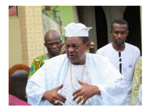
Figure 13. Aláàfin of Oyo, Oba Lamidi Adéyemí adorning his famous abetí ajá cap.

Gèlè is sourced from the material used for the ìró and bùbá for the female and filà is made from the same textile material for bùbá and şòkòtò or agbádá for the man. The woven textiles of the Yorùbá were well developed and supplied quality materials and designs which were rated higher than imported ones from Manchester (Atanda, 1980:26). This was in addition to the local dyeing industry which produced àdìrę eléko (tie and dye) and àdìrẹ eléko (dyed material with local cassava starch).