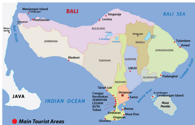
Figure 1: Guide Map of Bali

As it had been described earlier, moratorium essentially constitutes a policy evaluation. Normally, a moratorium is taken after considering pros and cons of a particular policy. In this context moratorium is not only possible, but quite probable. For the sake of tourism, a number of policies are revised, amended or just abandoned. Hardly ever in the previously-centralized autocratic government systems, the implementation of a policy taken by a province is challenged nor denied by the lower level of local government.