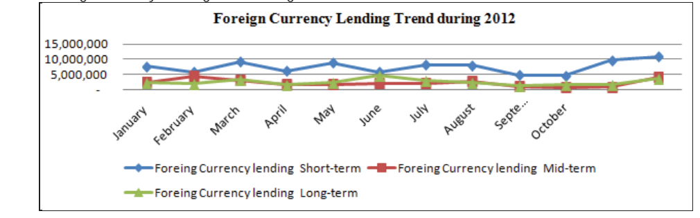
Table. 5. Foreign Currency Lending Trend during 2012