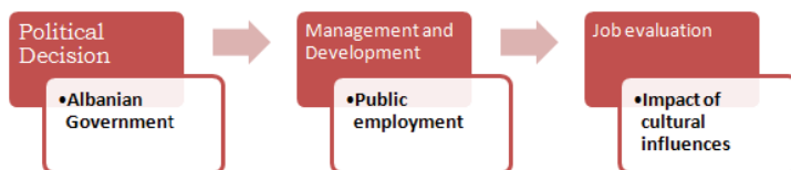
Graph 1: The heads of central and local government institutions

to be the missing link between putative and real equality in terms of access to employment, businesses, credit institutions, health care and social services. There are also questions about gender equality in civic participation and political decision-making. Albanian law prohibits gender discrimination and job segregation in public and private employment.