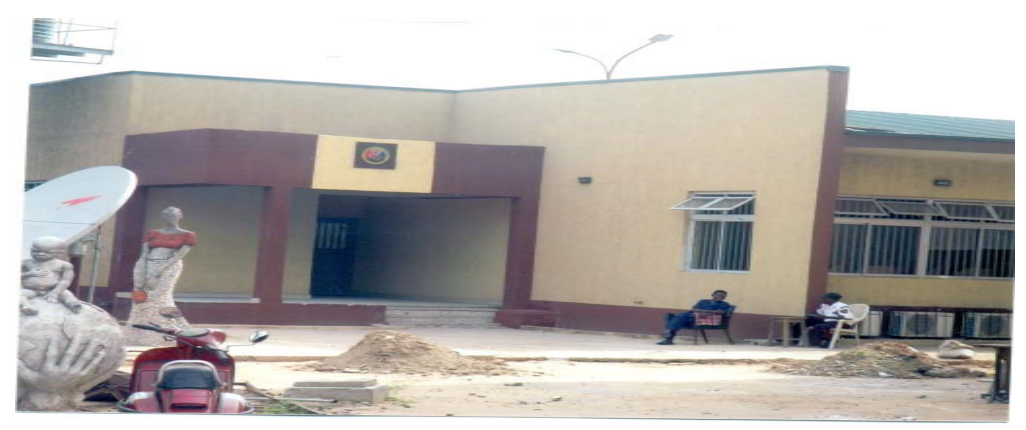
Figure 4 : Just Completed multimillion Naira Computer Laboratory for Practical computer Training for students and Staff