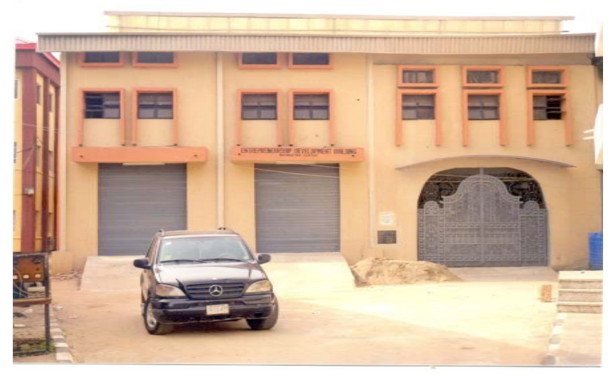
Figure 3 : Completed EDP center, where students acquire knowledge practical knowledge on entrepreneurship development