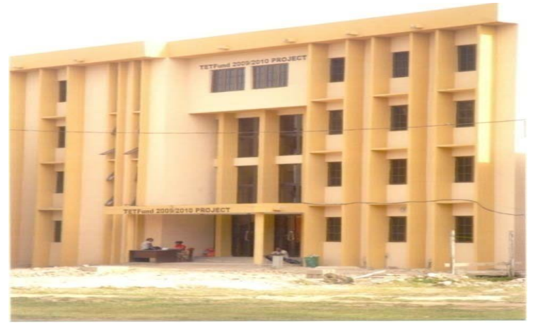
Figure 1: Just completed new school of Science with several classrooms, laboratory and staff offices.

Data here are present in figures: It includes the various completed and ongoing project between 2008 and 2012.