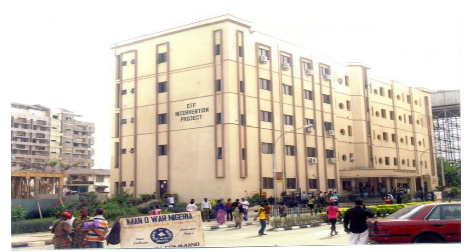
Figure 2 : Completed 5 stories building named ETF building with several classrooms, lecture theater and staff offices.