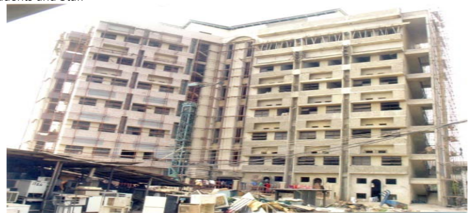
Figure 5 : Ongoing multipurpose 12 stories building, first of it is type in the history of Nigeria polytechnics and colleges of technology.