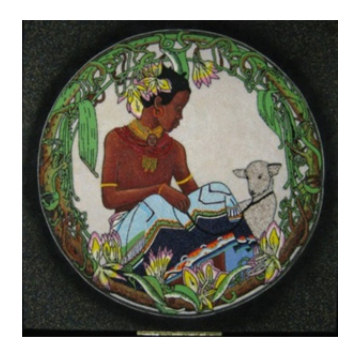
Figure 11: Plate 11 "African Child" (2005)