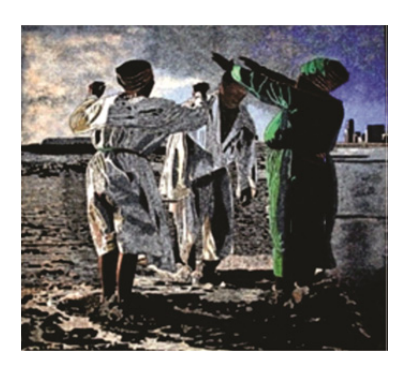
Figure 4: Plate 4 "In the Spirit" 1996