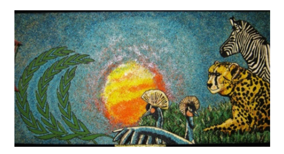
Figure 3: Plate 3 "Peace in the Wilderness" (1994)

In Nigeria, it is a common phenomenon to see people along the beaches praying, or performing one spiritual activity or the other; Dale's beadwork "In the Spirit" (Plate 4) is a reflection on this practice. The work shows three people, one of them bends a little, while the other two raise up their hands as they pray for the other one. The skyscrapers at the far end of the work suggest that the scene is along a beach in the metropolitan city of Lagos. The term: "In the Spirit" is commonly used among charismatic Christians to denote a circumstance in which someone falls into celestial realms, having encountered the power of the Holy Spirit. Csordas (1997) has observed that in the charismatic religious circles, resting in the spirit can be used to demonstrate divine power, or the faith and devotion of the Christian faithfuls in consecrating themselves to be able to commune with God so as to receive divine healing and other spiritual blessings.