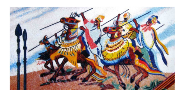
Figure 13: Plate 13 "Durbar" (2006)