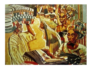
Figure 5: Plate 5"Yoruba Cloth Market" (1980)

The word "Caravan" usually refers to merchants or pilgrims organized into cluster groups so as assist one another while travelling through the deserts especially in Africa and Asia. Animals that are usually used for these long distance journeys include the camel, donkey, and the South American Ilama. A caravan could be between eighteen (18) and one hundred and fifty (150), or more camels, arranged into about eight or more files, with a camel-puller that controls each file. As shown in the beadwork, the camel-puller controls the first camel of his file by a rope tied to a peg and attached to the camel's nose; other camels in the file are led in a similar way, following the one in front. In the caravan, one or two people are in charge of preparing food; further, one of the camel-pullers must be someone with vast experience, and there must be a caravan master on whose shoulder the overall welfare of the caravan rests.