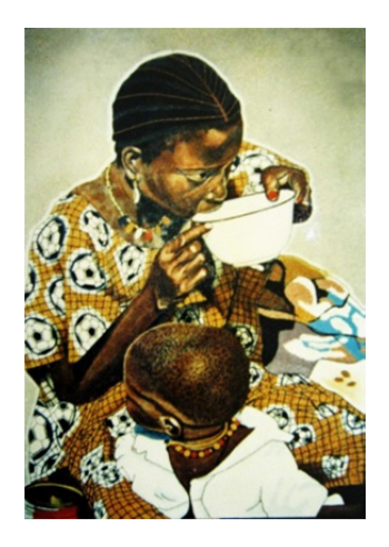
Figure 8: Plate 8 "Mother and her Child" (1986)

"In the Country" (Plate 9) emphasizes the dramatic aspects of nature with beautiful streamscape, flourishing trees, and brilliant sky. It is one of the biggest beadworks of Dale, measuring 161 by 305 centimeters. The work shows the countryside, an environment in a condition relatively unaffected by human activity. There is a hut on the right side with a woman cooking with fire wood. In the ecosystem, organisms and their environment constantly interact, this interaction usually affect the organisms and may change the natural course of the environment. Some of these human-induced changes include deforestation, and environmental pollution that lead to global warming. With the calmness expressed in this beadwork and the absence of human-induced destruction of the ecosystem, Dale is advocating ways of reducing the negative impact of human activity on the natural environment.