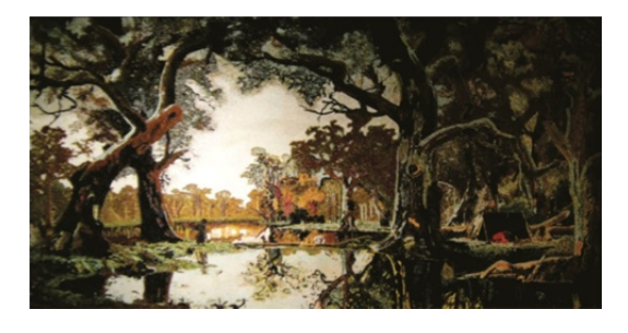
Figure 9: Plate 9 "In the Country" (1997)