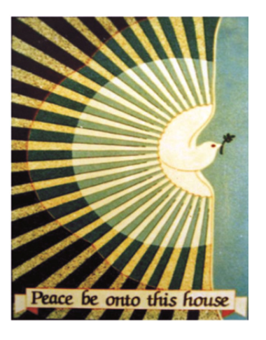
Figure 2: Plate 2"Peace be onto this House" (1994)

"Peace in the Wilderness" (Plate 3) shows a field with a zebra standing, a leopard in a reclining position, and two crowned-cranes. There are three rows of stylized leaves similitude of the United