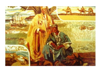
Figure 6: Plate 6 "Story of Cowries" (1980)