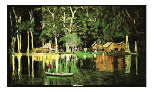
Figure 10: Plate 10: "As the Evening Falls" (1994)

"As the Evening Falls" (Plate 10) is the largest beadwork of Dale measuring 244 by 406 centimeters. Evening refers to the part of the day between afternoon and night, when daylight begins to fade as the sunset, and before bedtime; it could also refer to the final part of a period of time, especially somebody's life or a historical era. This beadwork depicts a small countryside community in a riverine area. It brings to mind the poem "It is a beauteous evening, calm and free" by Wordsworth; and, "Now the day is over" by Baring-Gould. As the evening falls, people are returning home after the day's work, to have a good night rest and re-invigorate for the next day's activities. Two boats are seen on the river, the boats serve as a means of transportation and fishing business. There are three people in each of the boats, the boats on the far right side is already at the shore, while the other boat at the centre is rowing back home. The architecture is majorly made of wood and thatches; and there are human activities going on in the environs. This thick forest settlement is devoid of topsy-turvy and industrial pollution that characterize the urban settlements and metropolitan cities. The effect of light as the sun sets gives a reflection of the timbers and architectures on the river; this gives the beadwork a dramatic effect. The shades of green that pervade the whole work imply productivity, agriculture, success, and bubbling of life.