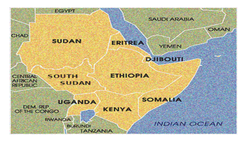
Figure 1: Map of the Horn of Africa

region has become an unstable region and constant political instability with both intrastate wars and interstates crisis of all manner which has plagued the region for a very long time. The most unfortunate part is that most of the states in the region are fragile, with weak institutions incapable of effective governance and maintenance of security and control of their borders. The HoA is a position in an outstanding geopolitical location southwest of the Red Sea and the Gulf of Aden. That location refers to these four countries namely, Ethiopia, Eritrea, Somalia, and Djibouti however, taken in a wider and economic context the term the Horn of Africa includes Sudan, South Sudan, Kenya, and Uganda. This is shown in Figure 1 below.