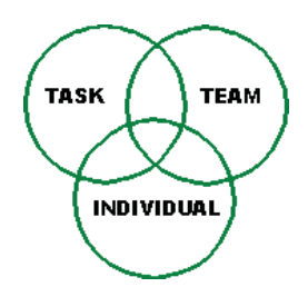
Figure 2 Adair's Action-Centred Leadership Model

Figure 2 above illustrates that the three circle diagram is a simplification of the variability of human interaction, but is a useful tool for thinking about what constitutes an effective leader/manager in relation to the job that he/she has to do. An effective leader must be able to carry out the functions and then demonstrate the behaviours, as portrayed above by the three circles. Different situations and contingent elements then call for different responses by the leader. As illustrated in Figure 2 above and in below, Bolden et al. (2003:11) states: "Hence imagine that the various circles may be bigger or smaller as the situation varies, i.e. the leader will give more or less emphasis to the functionally-oriented behaviours according to what the actual situation involves. The challenge for the leader is to manage all sectors of the diagram". As already mentioned, the behavioural theories are an improvement over the trait approach because it is observable, can be learned and they focus on what a leader does rather than on what a leader is (Brooks, 2009:171).