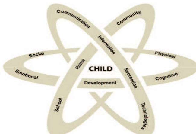
Fig 2. The Ecological Techno-Microsystem

Further, online behavior is not meaningfully described as use of communication, information, and recreation digital technologies. Online behavior "refers to organized (e.g., search) and unorganized (e.g., browse) interactions with both human (e.g. chat) and nonhuman (e.g., database) elements in online environments". Theoretically, the techno-microsystem has the capacity to, for example, coordinate children's learning experiences across home, school, and childcare environments, protect children from harmful at-home online experiences by community-based web-awareness initiatives, and prioritize school-based hardware for children without home connectivity.