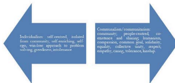
Figure 2: Individualism mode

The mode figured above is opposed to the individualism mode in figure 2. The individualism mode places a high premium on an individual person. It is opposed to communalism as illustrated through arrows pointing in opposite directions in figure 2. This mode has a potential to cause divisions in the community and is an enemy of ubuntu.