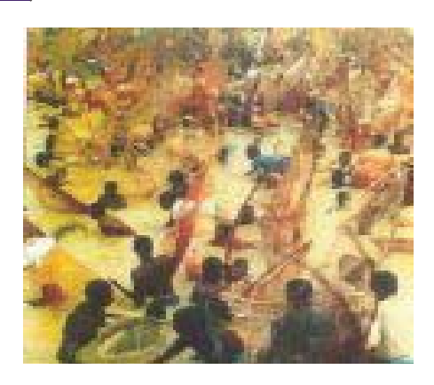
Plate II: The Argungu Fishing Festival in Kebbi, Nigeria.