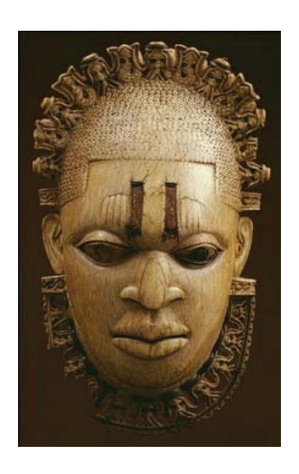
Plate I: Ivory mask from ancient Benin used as symbol for FESTAC '77

Interestingly, a number of Nigerian arts in foreign collection were 'stolen', hence the persistent calls by successive Nigerian governments, art organizations and individual stakeholders for reparations from countries that are still keeping them illegally. Perhaps, the earliest recorded case of looting of Nigerian arts and craft was when British troops invaded the ancient Benin Empire to retaliate the killing of British nationals by local authorities in 1897. During this invasion, popularly referred to as the 'Punitive Expedition', numerous Nigerian art pieces were illegally taken to Europe (Eyo 1977:132). Smuggling of Nigerian art continues to the present day, at times aided by Nigerians in what has become a multimillion Dollar illegal trade. Perhaps the only bright side of this illegality is the fact that indigenous Nigerian arts and craft products are increasingly popular, as they remain irresistible to collectors and tourists across the globe.