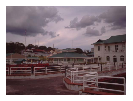
Plate IV and V : John Hughes's painting of Calabar Seaport in1880 (Left) and a photograph of the same location of the port, now developed into a tourist resort, 2007 (Right).

Paintings, sculpted images and photographs/postcards of natural environments and socio-cultural gatherings and festivals are some of the fastest-selling images in the Nigerian art market.