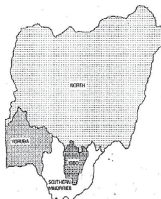
Fig. 1: Perceptions of the Old North – South Dichotomy

Consequently, the critical defining factors are clan, ethnic group, state, region or religion. However, ethnic identity remains the most politically important factor in politics. Still, often ethnic identity exists in complex relationships with other factors in defining politics in Nigeria. Sometimes politics is defined along the lines of ethno-regional identity as in the case of the North, South and Middle Belt, at other times it is defined in terms of ethno-religious groupings as in the Moslem North and Christian South; Other defining factors include minority versus majority ethnic groups, and numerous sub-ethnic identities (Ibeanu, 2005). Figures 1 and 2 show some of these divisions.