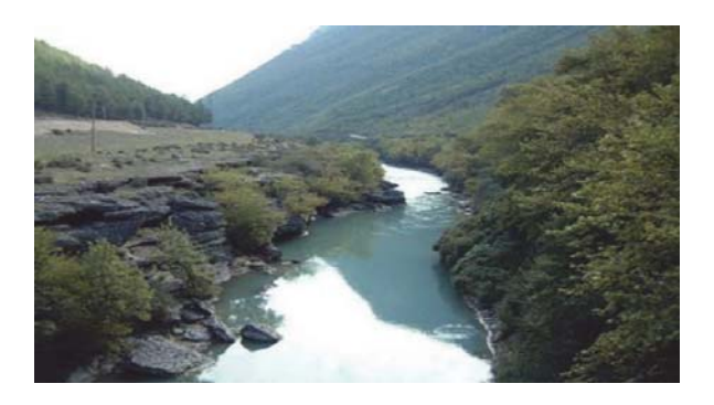
Fig. 1: Valley of Vjosë

Are known in the valley as some historical monuments like the cave dwellings Bënjës, medieval prejhistorike Piskovës tumuli, Grabovë, Rapckës, Këlcyra antiketë fortifications, Kuqarit, Byzantine churches of bualin or Kosinës and post-Byzantine of the Bënjës Leusës.