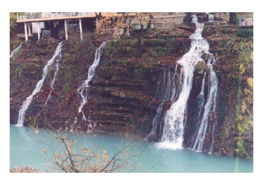
Fig Nr 6: Sources at the mouth of Këlcyra

Slightly above the bridge Dragot stream through a narrow river valley Zagories which discharges into waters Vjose mount crystal Gjirokastra (Zagories) and mount them to Malshovës .malshovës.bove all the gorge from both sides of the river flow Vjose multiple sources with abundant flow and inexhaustible source to the so-called black water.