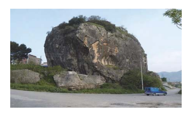
Fig Nr 7: The stone city

The small town of Përmet by size but not by culture traditions and history under the name of the legend as a symbol of inherited perpetuate an ancient hero named Prem. Përmet City or rightly called as the city is known for roses and flowers have the feeling that its citizens face in its entirety, starting with the flowers that adorn parks everywhere, Uncle, Gardens and Bazaar apartments. Përmeti appear as a town green and quiet, thanks to the smooth character of self Bazaar. Hospitality is a virtue as citizens Përmet are outstanding production of the housewives Bazaar as most fruit jam, plum with pink essence, nut cakes that are unique to the taste, as well as the variety of wines famous raki, but the city is known for Përmet historical houses feature gates, streets paved with typical arched bridges kallrëm in its suburbs etc.. Outside edge Vjosë is so-called natural monument stone city.