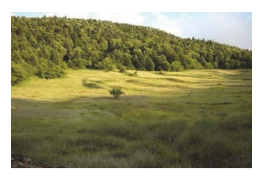
Fig Nr 3: Fir tree Hotova

Animal world is very rich, are all species Përmet area, where the most conspicuous brown bear, deer, wild boar.