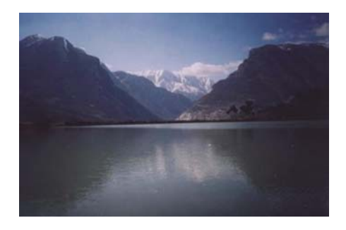
Fig Nr 4: Këlcyra Gorge or paradise of 1001source

It is located 200 m from thermal sources on both sides of the river Lengaricë. Begin with a height 30 m, width 2m by subtracting the first verse comes canyons being increased to up to 150 m and width 12 m thus becoming one of the most typical canyons thing that has attracted the attention of local and visitor foreign