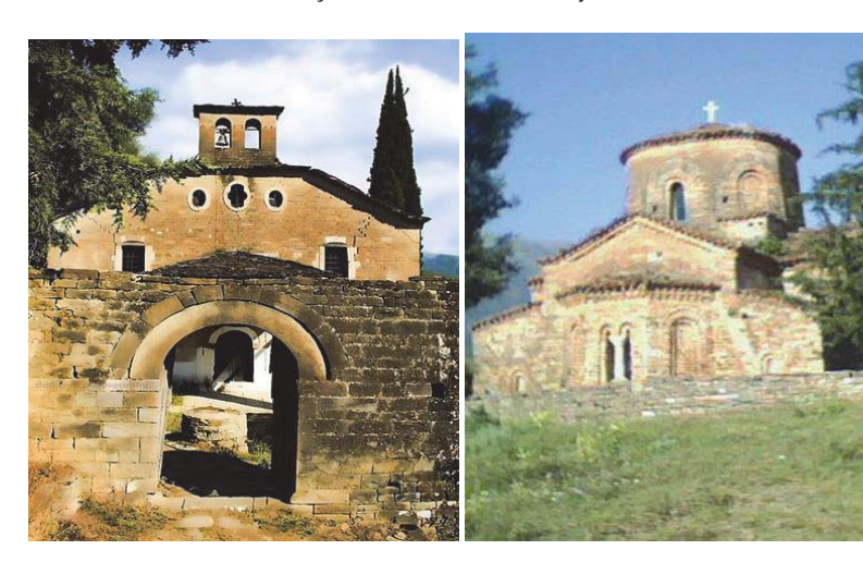
Fig Nr 2: Byzantine Church of Kosinës After Byzantine church of the Bënjë

In tests made by methods known spatial recent past but also information proved to be a high potential heritage values material. Based on territorial characteristics as slope, visibility, sunshine height above sea level landmarks tend to settle on similar terms geo-morphological (by GIS spatial analysis and digital models of heights) indicates what njëkoshme of unique features, in thus Përmet area offers great opportunities for green tourism as a whole mountain and culminating with special items with which this area is very rich and that their promotion is an enterprise with a future