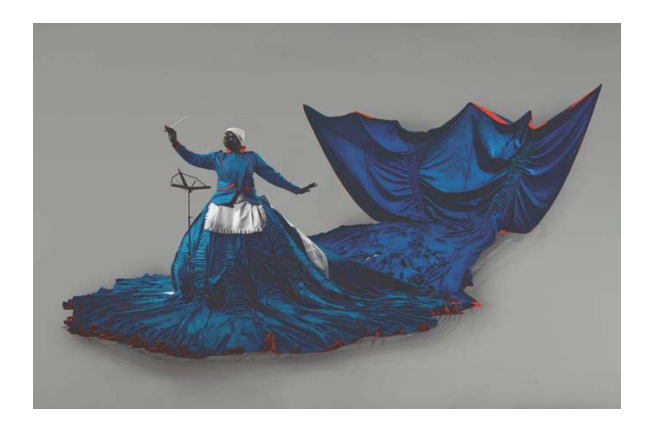
Figure 1. A depiction of the institutionalised limitations imposed upon generations of Black South African women who worked as domestic workers inspired by the artist's as well as the country's historical context. Adopted from the artwork entitled "Silent Symphony", archival print (Edition of 10), 90 x 60 cm (Sibande, 2010).

Throughout the ages, women, especially Black women, have suffered from historically entrenched stereotyping and myths (Few, Stephens, & Rouse-Arnett, 2003). Recognising the perceived vulnerability associated with this segment of the South African labour force, the researchers felt that excluding them from their research efforts would mean, "ignoring those whom society needs to understand and serve" (Sieber & Tolich, 2013, pp. 12–14). The research participants therefore were viewed as "historically, culturally and politically constructed entities with diverse identities" (Faircloth, 2012, p. 275). This view thus influenced how we conceived, approached, accessed and engaged with these individuals for data-generation purposes.