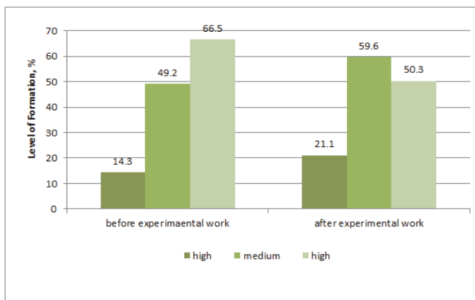
Figure 3 - Self-assessment survey results regarding the professional fitness and abilities of graduate students in teaching activities

With regard to self-assessment of professional fitness and abilities, there are a number of attributes that characterize the positive aspects of the ideal teacher. Figure 3 presents the results of a self-assessment survey regarding the professional fitness and abilities of graduates in teaching activities.