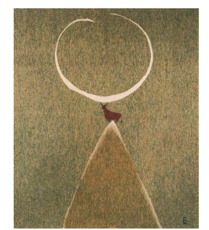
гобелен «Mountain of the world - II», 183x163 см., 2007 г.

This brings to mind the distant half-forgotten details that in Tengrian culture ox -like creature with a cold breath, always personified the night, which means friendly and correlated with nocturnal luminary - moon. And again, through a combination of minimal elements artists create for himself and for the audience creative image of time - bull on top of the mountain with the moon on the horns - a torch, universal beacon, illuminating the whole sublunary world. That's right, a representative of domestic cattle, by the will of the artist receives new figurative birth, appears in a crucial status in its original, archetypal form.