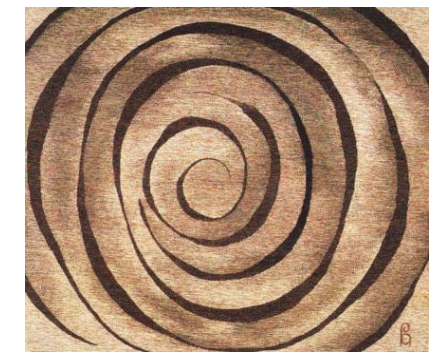
Tapestry "The Universe" (Univerce), 150x160 см., 1998 г.

Bapanova also take drawing spirals initial curl which have centered almost equilateral rectangular canvas. Then, alternately thickening, then thinning, and sometimes even briefly interrupting the line of the spiral movement to develop it as long as it does not go beyond the tapestry. As a result, the viewer sees a double helix illustration image: spiral and rose itself, if you look at her full-blown bud downwards. Taken together and combined into a single unit, the two image-symbol image inspired by the artists of the universe.