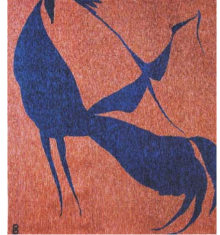
гобелен «Flagman», 180х156 см., 2010 г.

On the whole format of the vertical rectangle woven fabric figure of the rider. The stylized image of a standard bearer on horseback great elegance silhouette creative solutions found. He holds the flagstaff, which leads diagonally up over the edge of the composition itself cloth flag. Also, if is not placed within the picture plane, the head and tail of a horse go over the edge of the tapestry. This artistic technique makroeffekta when the author of the work the viewer closer to the image artificially achieved momentary etched. As if the standard-bearer inspired us with his presence, the next moment has to go to another, it is known to the measurement in order to continue its mission.