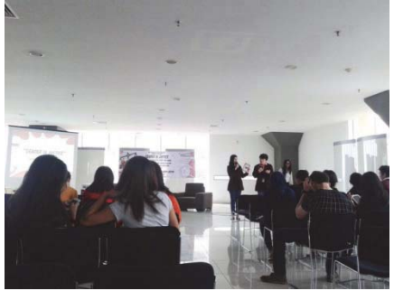
Figure 2. Socialization of Handbook of Violence Prevention through the Seminar on Gender in Justice

Figure 1. Handbook of Violence Prevention