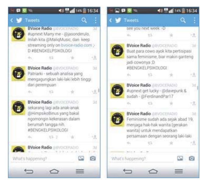
Figure 4. Twits about Violence Against Women at BVoice Radio

Figure 3. BINUS Psychology Department @BVoiceRadio Campaigning Gender Equality