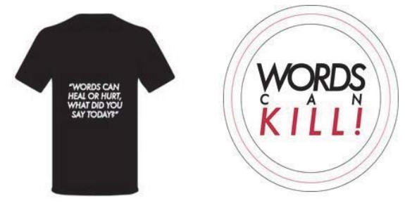
Figure 5. Shirt and Pin for Social Intervention

Mediterranean Journal of Social Sciences MCSER Publishing, Rome-Italy