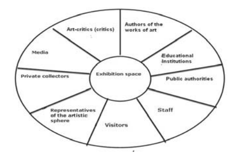
Figure 2. Public group art project, where are various kinds of communication