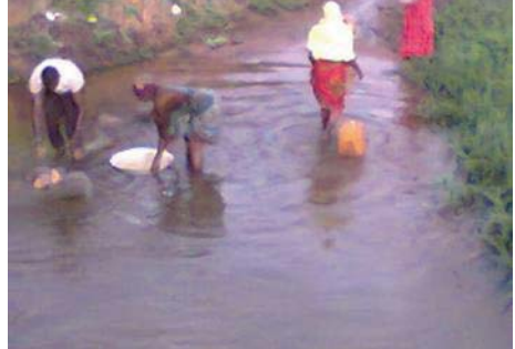
Plate 4: Ankpa Urban Residents abstracting water from Market Road section of Imabolo Stream.

This intake of water from stream with unascertained concentration levels of chemical compounds and bacterial (EPA, 2008), can result to incidents of water-related diseases among the urban dwellers. The dearth of basic scientific information about water quality parameters has also created problems of planning and management of this resource as