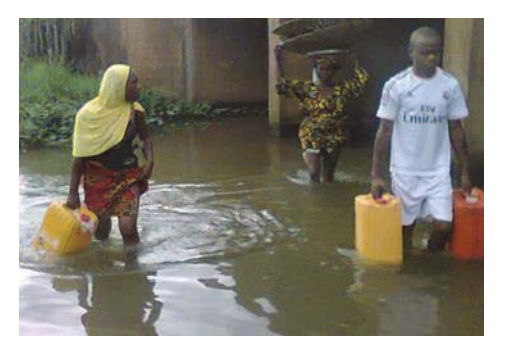
Plate 3: Ankpa Urban Residents abstracting water from Bridge-head section of Imabolo Stream.