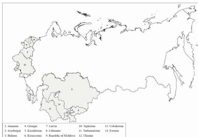
Figure 6. Post-Soviet states as of 01.01. 2014

Calculated and compiled by the author based on (Federal..., 2004b; Federal..., 2005; Federal..., 2006; Federal..., 2007; Federal..., 2008b; Federal..., 2009; Federal..., 2010; Federal..., 2011; Federal..., 2012b; Federal..., 2013; Federal..., 2014c; The United..., 2012; The United..., 2013).