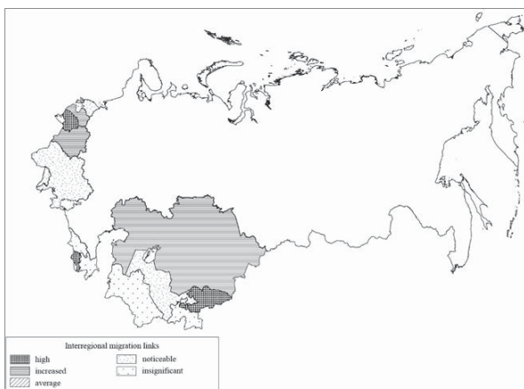
Figure 10. The Kaliningrad region's coefficient of intensity of outgoing migration links with post-Soviet states (2003-2013) Calculated and compiled by the author based on (Federal..., 2004b; Federal..., 2005; Federal..., 2006; Federal..., 2007; Federal..., 2008b; Federal..., 2009; Federal..., 2010; Federal..., 2011; Federal..., 2012b; Federal..., 2013; Federal..., 2014c; The United..., 2012; The United..., 2013).