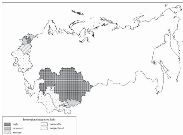
Figure 4. The Kaliningrad region's coefficient of intensity of incoming migration links with post-Soviet states (1992-2002) Calculated and compiled by the author based on (State..., Federal..., 2001; Federal ..., 2002b; Federal ..., 2003; The United..., 1994; The United..., 2003).