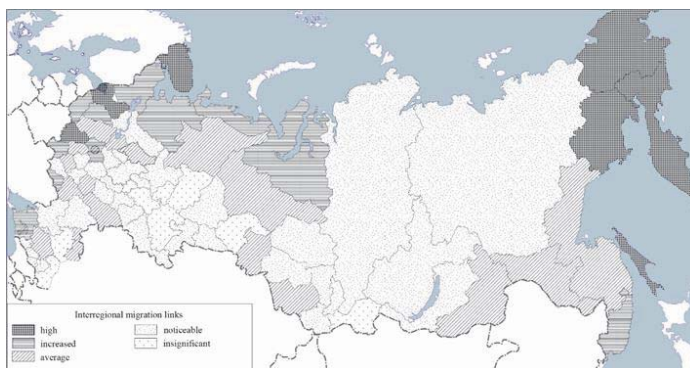
Figure 8. The Kaliningrad region's coefficient of intensity of outgoing migration links with Russian regions (2003-2013) Calculated and compiled by the author based on (Federal..., 2014b; Federal..., 2004b; Federal..., 2005; Federal..., 2006; Federal..., 2007; Federal..., 2008b; Federal..., 2009; Federal..., 2010; Federal..., 2011; Federal..., 2012b; Federal..., 2013; Federal..., 2014c).