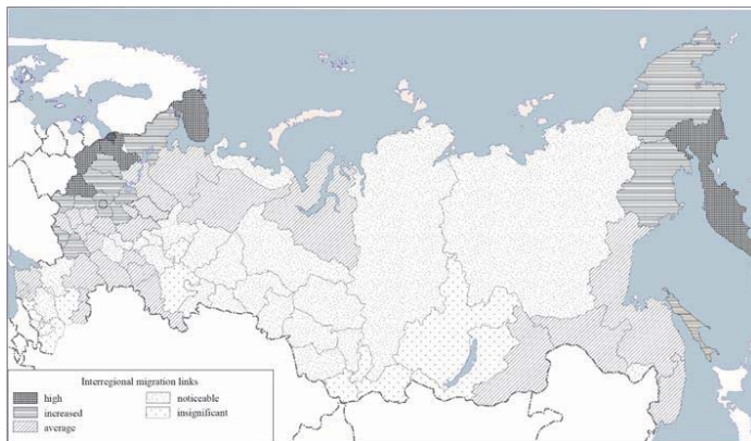
Figure 7. The Kaliningrad region's coefficient of intensity of outgoing migration links with Russian regions (1992-2002) Calculated and compiled by the author based on [State..., 2002a; Federal..., 2001; Federal ..., 2002b; Federal ..., 2003)

The Central compact area divided into two isolated areas of the Belgorod and Moscow regions. Additional isolated areas emerged in the Yamalo-Nenetsky autonomous area, and Krasnodar region.