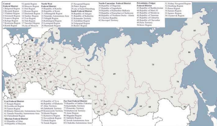
Figure 3. Russian regions as of 01.01.2014