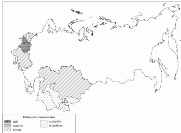
Figure 9. The Kaliningrad region's coefficient of intensity of outgoing migration links with post-Soviet states (1992-2002) Calculated and compiled by the author based on (State..., Federal..., 2001; Federal ..., 2002b; Federal ..., 2003; The United..., 1994; The United..., 2003).

In the 2000s, the principal area of outgoing migration localised in post-Soviet states and the intensity of migration links between them increased. The isolated area of Lithuania and Latvia comprised the Baltic compact area with a CMLI of 2.33. Kyrgyzstan and Kazakhstan formed the Central Asian compact area with an average CMLI value of 3.09. A new isolated area emerged in Armenia – a country characterised by the increasing intensity of migration links (fig. 10). On the contrary, the isolated area of Belarus demonstrated a decreasing intensity.