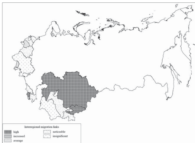
Figure 5. Coefficient of migration link intensity of Kaliningrad region with the neighbouring countries upon arrival (2003-2013)

Calculated and compiled by the author based on (Federal..., 2004b; Federal..., 2005; Federal..., 2006; Federal..., 2007; Federal..., 2008b; Federal..., 2009; Federal..., 2010; Federal..., 2011; Federal..., 2012b; Federal..., 2013; Federal..., 2014c; The United..., 2012; The United..., 2013).