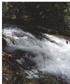
Figure 2: This Waterfall is one of the major heritage tourism attractions at Ezeagu Tourist Complex that are still abandoned as a result of hosts' perception of impacts.