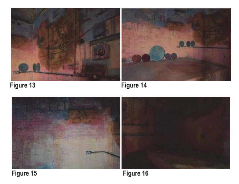
Figures 13-16: Margrethe Kolstad Brekke, Anthropocene Diorama, watercolor, 2013, the original site of Spode factory