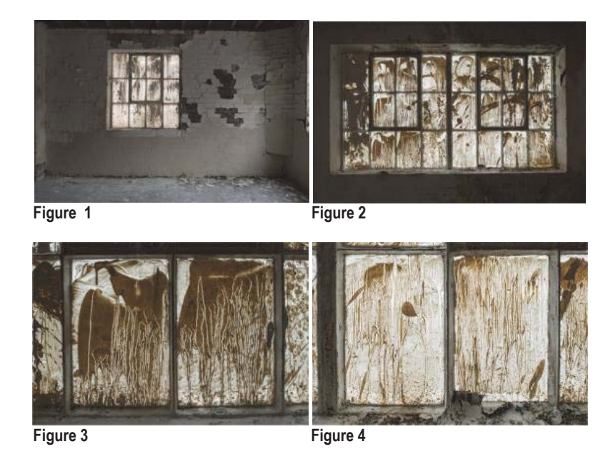
Figure 1-4: Tina Gibbs; Clearance; Thin clay; 2013; the original site of Spode Factory