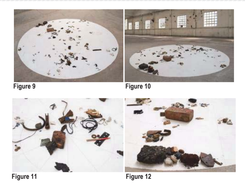
Figures 9-12: Lena Kaapke, Field Investigation, the objects found around the plant, 2013, the original site of Spode factory.