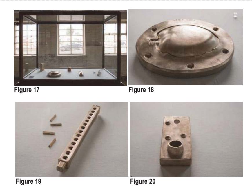
Figures 17-20: Heidi Nikolaisen, Contemporary Keepsake, bronze, 2013, the original site of Spode factory