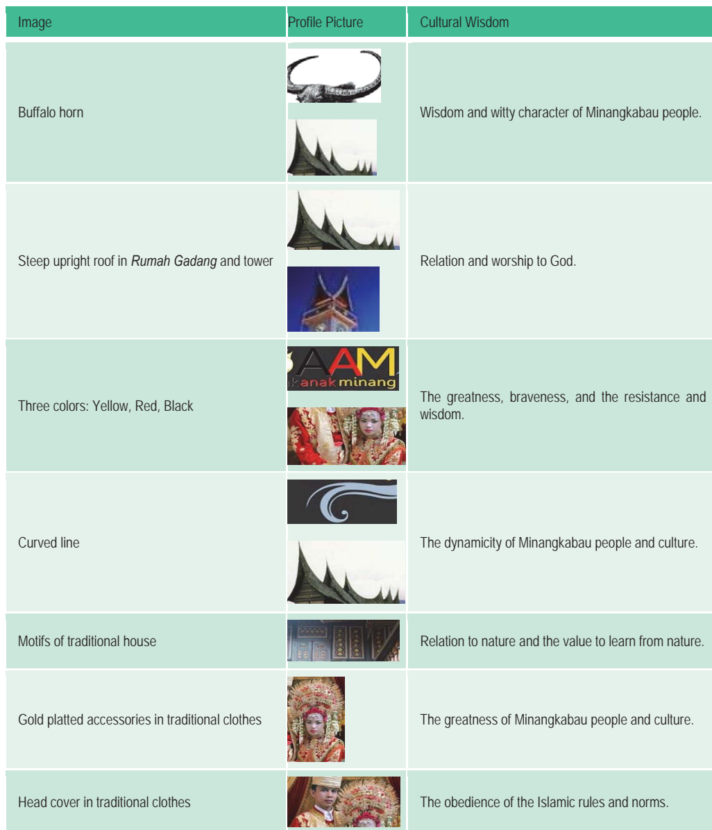
Tabel 1. Relation between Image and Cultural Wisdom of Minangkabau

Each samples of Minangkabau's profile picture contains elements of image which has meanings in cultural context and values. The specific forms and colors captured in elements of the image above.