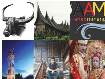
Figure 4. Examples of Minangkabau's Profile Picture

On the other hand, in a real world there is a person's nature identity. A person's nature identity includes race and ethnicity. Ethnicity is both a physical fact and a cultural creation from a certain ethnic community. It refers to a sense of group affiliation based on a distinct heritage of worldview as people. Ethnicity is a cultural concept centered on the sharing norms, values, beliefs, cultural symbols and practices (Barker, 2012: 255). The formation of ethnic groups relies on shared cultural signifiers that have developed under specific historical, social, and political contexts.